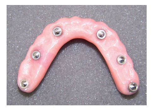
Figure 10: The flat fit surface was manufactured and polished to aid good healing