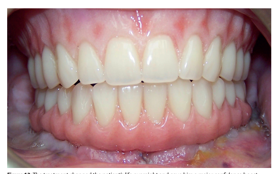
Figure 13: The treatment changed the patient's life overnight and gave him a major confidence boost, along with the ability to enjoy food he had not been able to eat for some time

When the titanium bar was received at the laboratory, the try-in wax-up was transferred to the bar and a final patient sign-off was obtained.