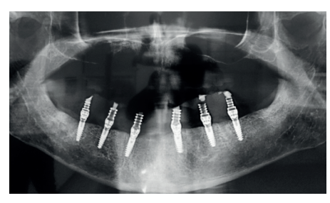
Figure 3: Six Axiom TL narrow implants with Inlink connections were placed in the lower jaw