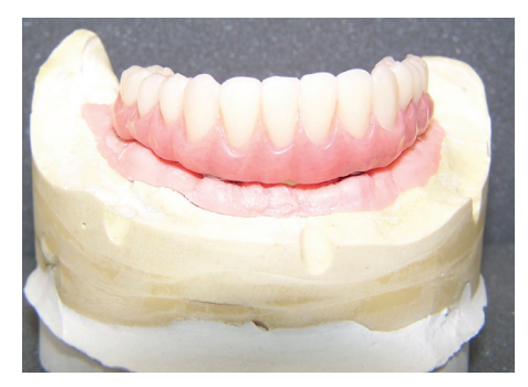
Figure 9: The junction between the bridge and tissue was fairly even, making it easy to clean