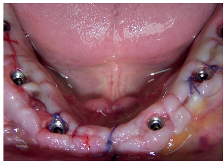
Figure 11: After 24 hours, soft tissue healing was progressing well