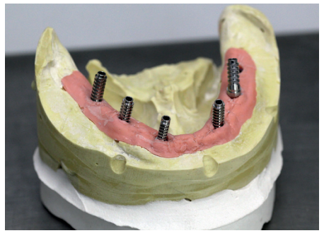
Figure 8: A model was cast and temporary cylinders were placed in the best position