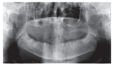
Figure 2: Panoramic X-rays and 3D cone beam CT images were taken to confirm the amount of resorption that had occurred and the density of the remaining bone