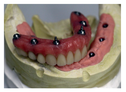
Figure 12: The Inlink connections made attaching the prosthesis quick and simple

cylinders and teeth in the correct position. The definitive upper denture was processed in Ivoclar Vivadent SR Ivocap.