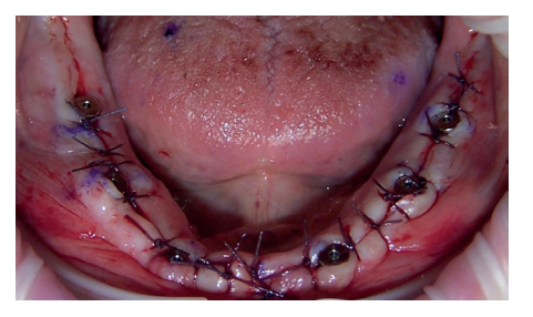
Figure 4: The flap was closed with sutures